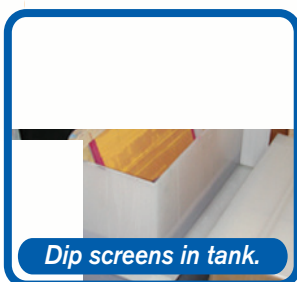
Dip screens in tank.

Franmar's revolutionary INK + EMULSION REMOVER is formulated for dip tanks to clean ink and emulsion from screens in one simple step! Efficient, economical, and environmentally friendly, it removes traditional plastisols and UV inks after soaking for only 3 to 5 minutes. When the solution is ready to be replaced, Franmar's Neutralizer changes its pH to neutral for safe drain disposal. Available sizes: 2.5 Gallon, 5 Gallon